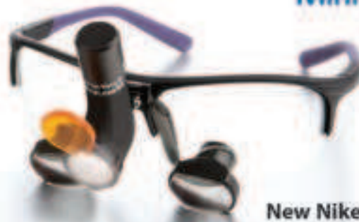
New Nike Run frame shown with LED DayLite® WireLess Mini

Totally WireLess Headlights — no wires, no battery pack