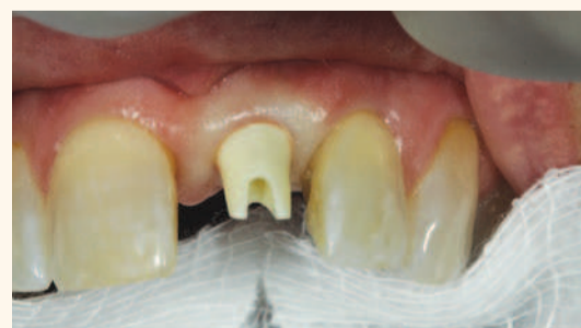
Fig. 17. Abutment torqued and ready for crown seat.