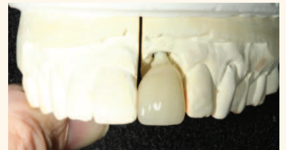
Fig. 14. eMax crown on abutment.