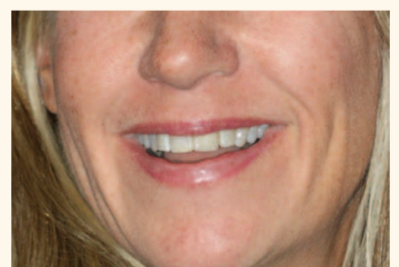
Fig. 20. Patient postoperative smile.