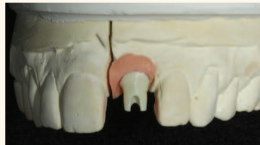
Fig. 13. Abutment with soft tissue moulage.