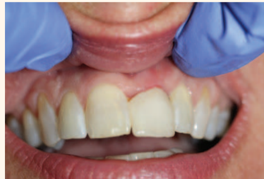
Fig. 1. Initial appearance.

The provisional restoration was poorly adapted to both the abutment and to the ridge crest soft tissue. Intaglio surface was rough and made in such a manner as to create a ridge lap profile. The facial and proximal surfaces of the provisional were fitted over soft-tissue crest. There had been no attempt to modify gingival tissue emergence profile or to create the environment for inconspicuous transition from restoration to biologic tissues.