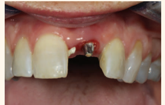
Fig. 2. Provisional removed.

Techniques for managing emergence profile are well-documented in the literature. Interproximal tissues will point and form papillae when appropriate lateral pressure is applied with a temporary abutment when natural teeth are on either side of the implant. The adjacent bone height will dictate the level of the papillae assuming the restoration and its associated abutment properly support them. 5 Facial contour can be manipulated to create appropriate gingival zenith height by increasing or decreasing facial emergence profile. Increasing the profile will move the gingival zenith apically and reduction of contour will move the crest incisally. 6