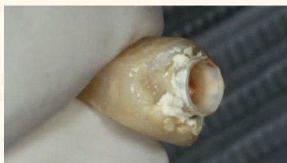
Fig. 3. Provisional lateral intaglio.

Once the abutment was perfected, an all-ceramic crown was fabricated (eMax, Ivoclar). This crown was waxed to full contour, and then the facial was cut back to provide a field into which a customized facial surface could be developed from added porcelain. The wax pattern was invested and pressed. The resultant crown was then modified with additional application of porcelain and was left preglazed in anticipation of chairside staining 7 (Figs. 13,14).