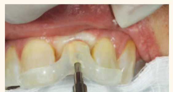
Fig. 16. Placing abutment with seating jig.