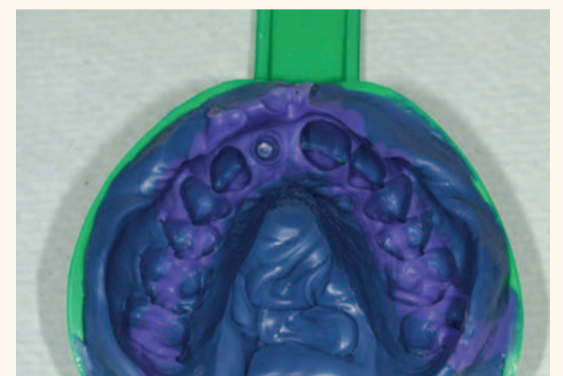
Fig. 12. Final impression.