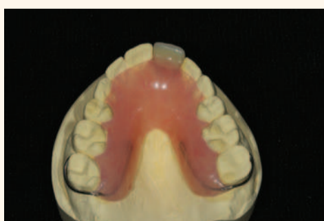
Fig. 6. Temporary partial.