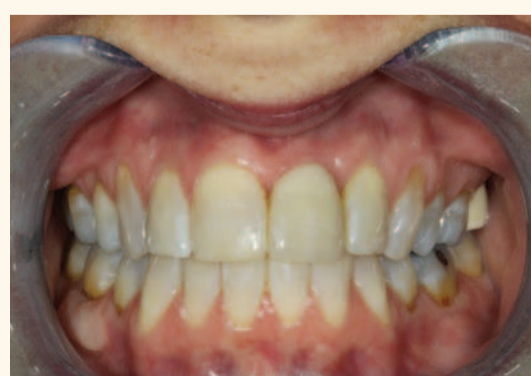
Fig. 19. Final restoration at two weeks.