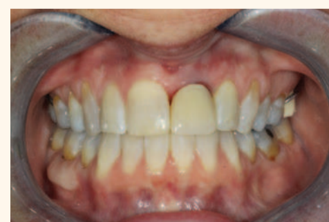
Fig. 8. Temporary partial placed.