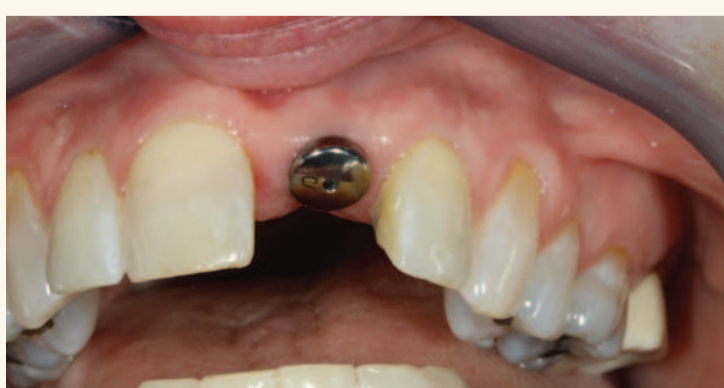
Fig. 9. Tissue healed and emergence profile established at two weeks.