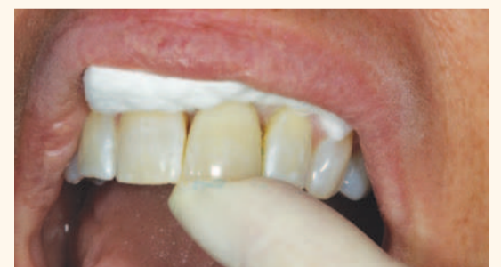
Fig. 18. Seating crown.