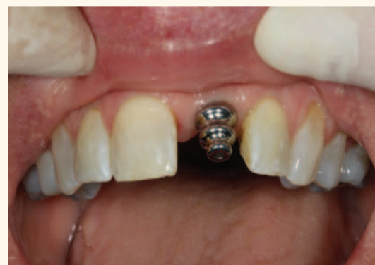
Fig. 11. Ankylos impression coping placed.