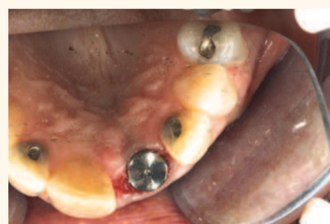
Fig. 7. Ankylos sulcus former.