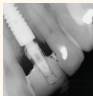
Fig. 4. Provisional abutment and crown.