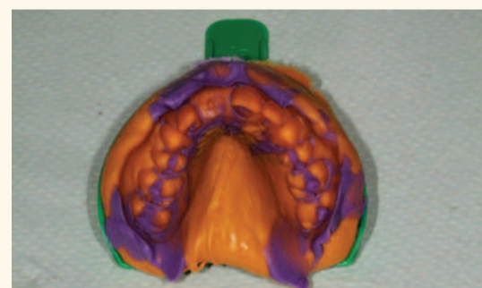
Fig. 5. Impression for temporary partial.