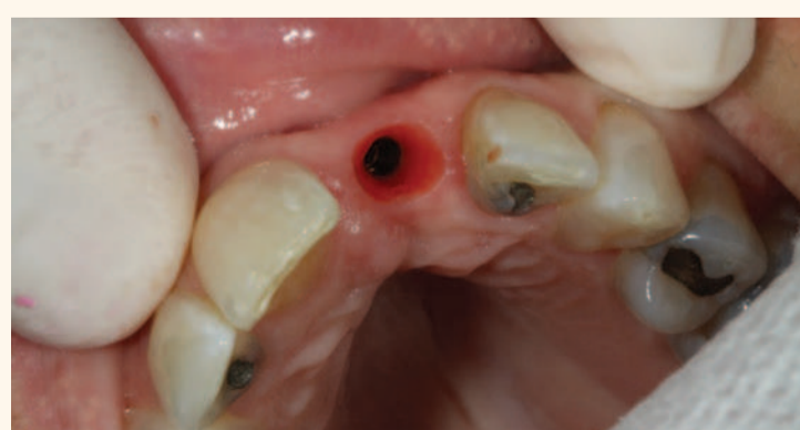
Fig. 10. Sulcus former removed.