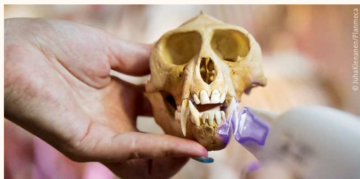
A skull being examined with the PlanScan intra-oral scanner. Read how Planmeca's 3-D imaging devices have helped advance fossil research. ► BUSINESS Page 8

The company's minimal intervention approach was developed based on an MI concept proposed by the FDI World Dental Federation in 1999 and introduced one year later. In order to enable realisation of the concept in clinical practice, the GC Europe MI Advisory Board later developed the Minimal Intervention Treatment Plan.