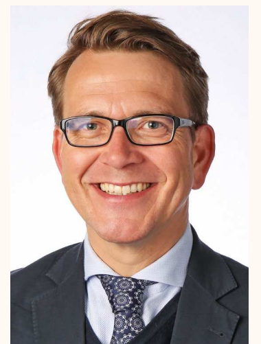
Prof. Jörg Eberhard

“A holistic view on medical conditions that includes oral health has not been established in clinical medical practice.”