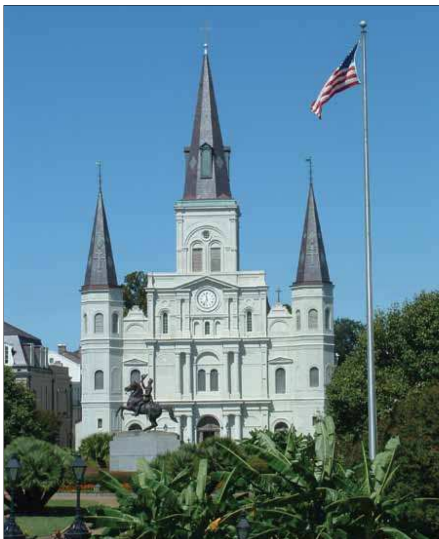
St. Louis Cathedral is located in Jackson Square, in the heart of the French Quarter of New Orleans.

AAE17 offers more than 100 educational sessions in a variety of tracks, including "Pulp Fiction," which will address controversial and misunderstood topics in the specialty; "Saving the Natural Tooth," sharing the latest evidence and recommended treatments to save patients' teeth; and "Surgical and Non-surgical Endodontics." The highlight of the surgical endodontics track is live, 3-D microsurgery. Dr. Synguk Kim will per-