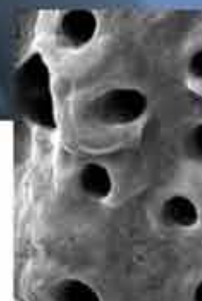
A higher standard of clean with the GentleWave Procedure 5