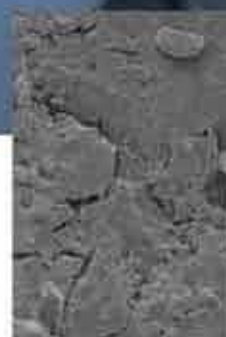
Debris left behind after standard RCT 4

Talk to Sonendo ® about the GentleWave ® System today. Make the real difference for your patients and the economy of your practice. Visit sonendo.com/get-real .