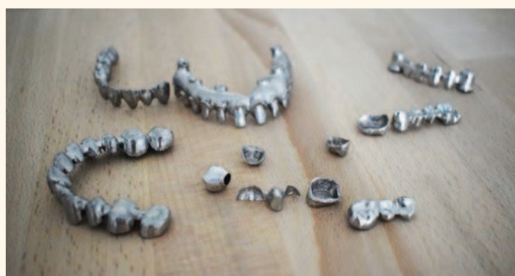
Metal 3D Printed Crowns and Bridges