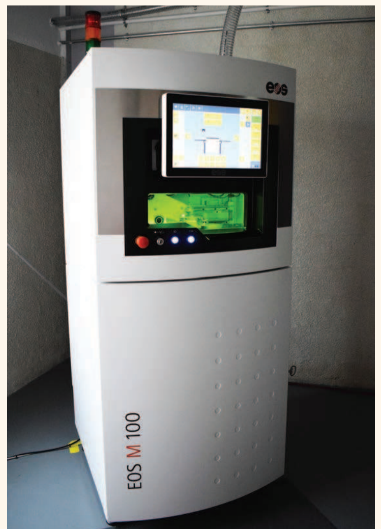
Sinterex's German Made EOS Printer