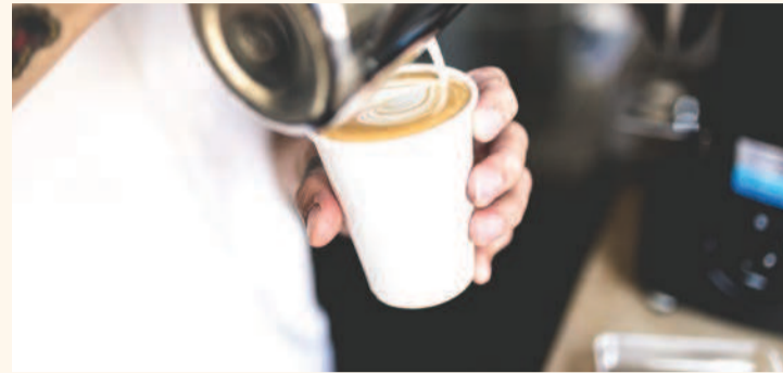
Coffee is one of the world's most popular beverages; however, it is known for its tooth staining properties. A study has now tested how various CAD/CAM materials reacted to immersion in coffee.

The study, titled "Discoloration of various CAD/CAM blocks after immersion in coffee", was published in the February issue of the Restorative Dentistry and Endodontics journal.