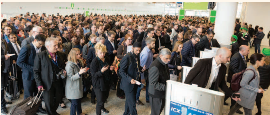
IDS 2017 saw over 155,000 participants from all over the world.

At the fair, 2,305 companies from 59 countries (compared with 2,182 companies from 56 countries in 2015) exhibited in an overall area of 163,000 m 2 (158,200 m 2 in 2015). These included 624 exhibitors and 20 additionally represented companies from Germany (636 and 19, respectively, in 2015), as well as 1,617 exhibitors and 44 additionally represented companies from abroad (1,480 and 44, respectively, in 2015). The proportion of foreign companies was 72 per cent (70 per cent in 2015). Of the more than 155,000 visitors from 157