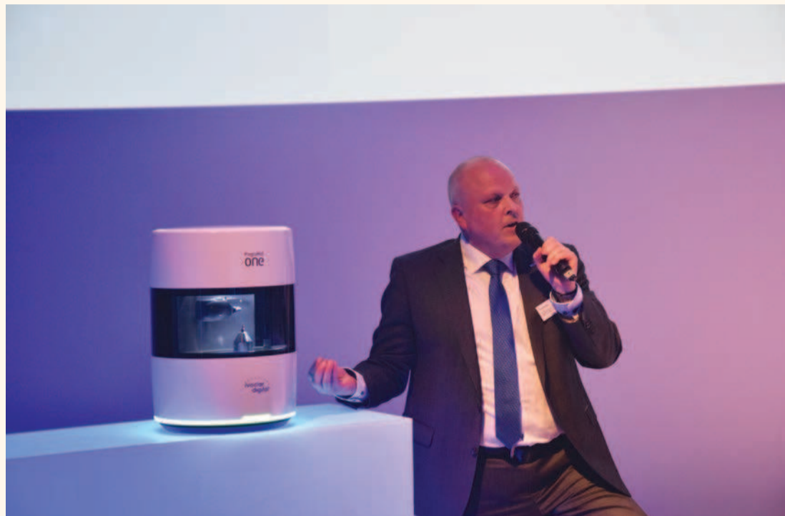
PrograMill One is the world's smallest 5-axis milling machine, according to Ivoclar Vivadent.