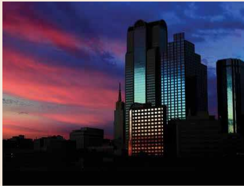
Dallas will be the site of the inaugural Glidewell Dental Symposium in November.

Glidewell Dental is an ADA-CERP recognized provider and an Academy of