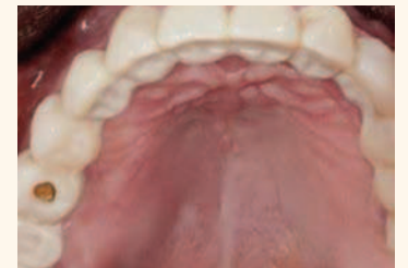
Fig 4: Long-term framework in PAEK

However, PAEKs also additionally possess sufficient strength to be considered as a metal alternative.