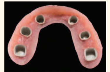
Fig 2: PAEK removable denture

Obtaining an increasingly stronger material becomes academic since clearly it would be simplistic to prefer the highest value. Metals have very high compressive strengths relative to PAEKs but are not shock absorbing. Naturally, a design must also consider the influence of thickness and shape as well, but values for flexural strength and elastic modulus are more indicative of the stiffness of a material and how much it will deflect the load. Stiffer materials, like metals, have a high elastic modulus (see Table 1) meaning that metals require high loads to elastically deform them. Therefore, one can look at natural materials like bone for clues as to an ideal for stiffness. Common denture materials like PMMA have an elastic modulus range of 1.8-3.1 GPa, but limited strength. The PAEKs have an elastic modulus closer to bone (4-5GPa) allowing the framework to be stiffer, yet still shock absorbing.