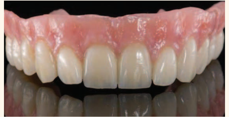
Fig 1: PAEK removable denture

PAEK materials further extend these CAD/CAM efficiencies when com-