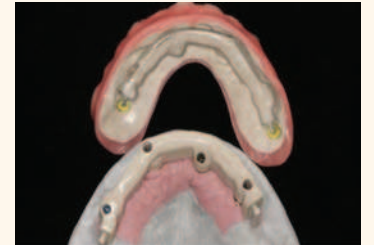
Fig 3: PAEK implant borne prosthesis