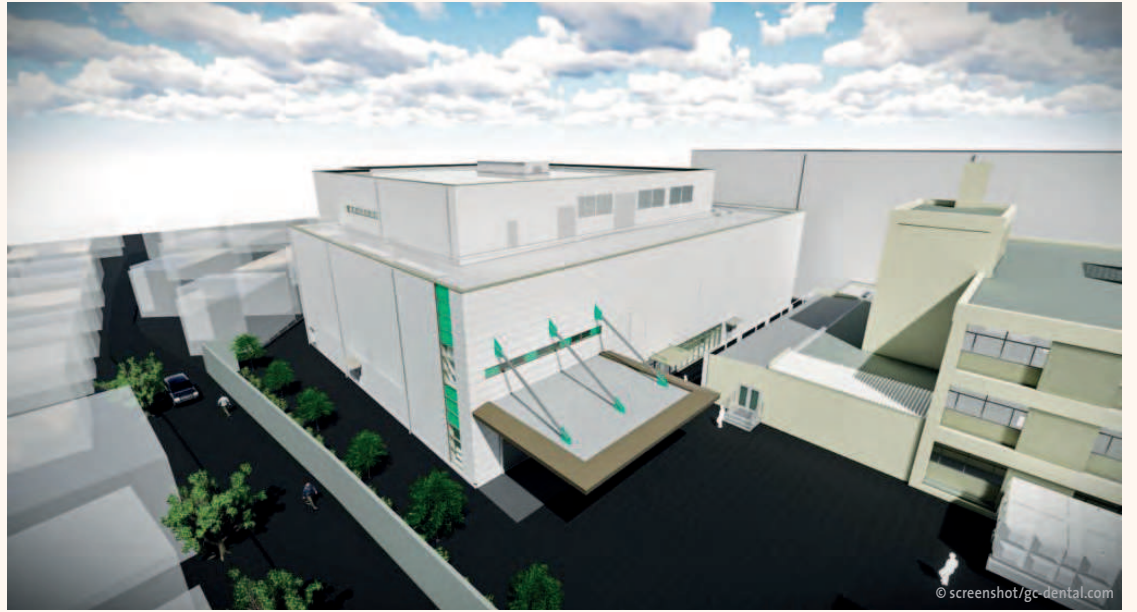
A mock-up of GC's new site in Kawasaki.

Showa Yakuhin Kako is one of Japan's leading dental pharmaceutical manufacturers and known for its range of local anaesthetics and medication for treating periodontal disease. Building on the synergistic effects of combining both compa-