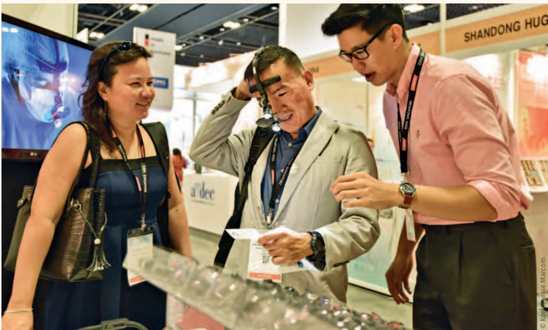
Hosted at the Suntec Singapore Convention and Exhibition Centre, IDEM 2018 will be held under the theme "Striving for clinical excellence".

Online registration for IDEM 2018 is now open at www.idem-singapore.com .