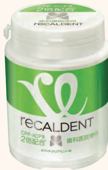
Big in Japan: RECALDENT gum is the largest selling sugar-free gum in the Asian country. Furthermore, Japanese dental company GC has incorporated RECALDENT into a wide range of products.