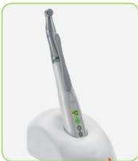
IA-400 Digital torque wrench