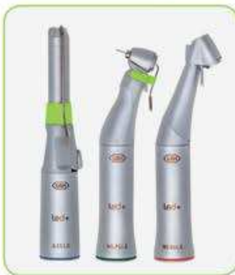
Surgical straight and contra-angle handpieces with or without Mini LED+