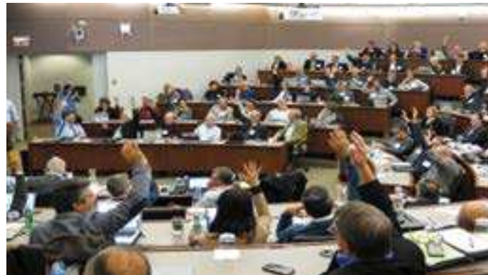
The World Workshop on the Classification of Periodontal and Peri-Implant Diseases and Conditions took place Nov. 9-11 in Chicago.

Participants conducted literature reviews, established case definitions and deliberated diagnostic considerations for the following topic areas: periodontal health and gingival diseases and conditions; periodontitis; developmental and acquired conditions and periodontal manifestations of systemic conditions; and peri-implant diseases and conditions. The inclusion of peri-implant diseases and conditions within periodontal