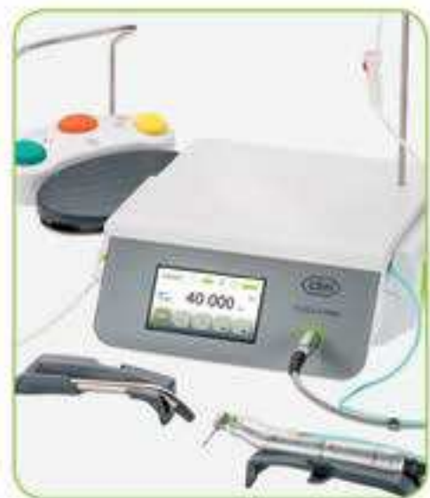
NEW Implantmed SI-1015 with wireless foot pedal option, Osstell ISQ option and LED powered motor option

Please visit us at the AAOMS in booth # 1310 to experience the latest in W&H surgical products! You can also go to www.wh.com/na for more information