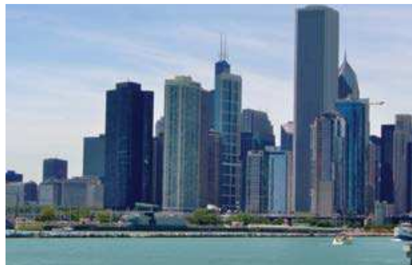
Chicago will be the site of the 25th AAOMS Dental Implant Conference from Nov. 30 to Dec. 2.