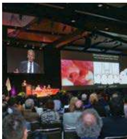
Attendees take part in an educational session at the 2017 AO Annual Meeting.