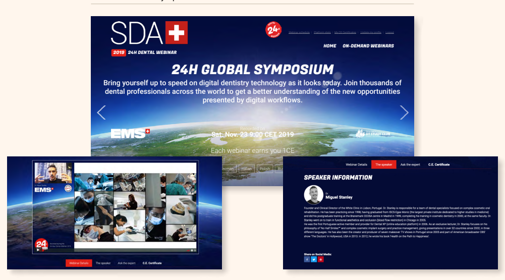
EMS 24H Global Symposium

The Dental Tribune (DT) Study Club offers custom branded 24-hour webinar websites, at which companies have the exclusive opportunity to broadcast a series of online lectures for one whole day. Within a 24-hour period, up to 24 webinars with up to 24 speakers, targeted at a specific audience, i.e. dental professionals from various specialties, such as implantologists, endodontists or orthodontists, can be presented on this customized platform.